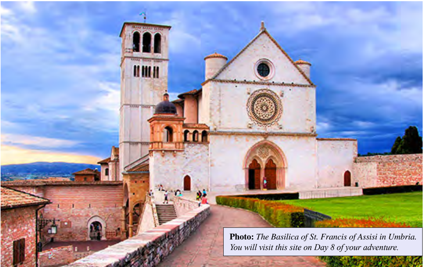
Photo: The Basilica of St. Francis of Assisi in Umbria. You will visit this site on Day 8 of your adventure.