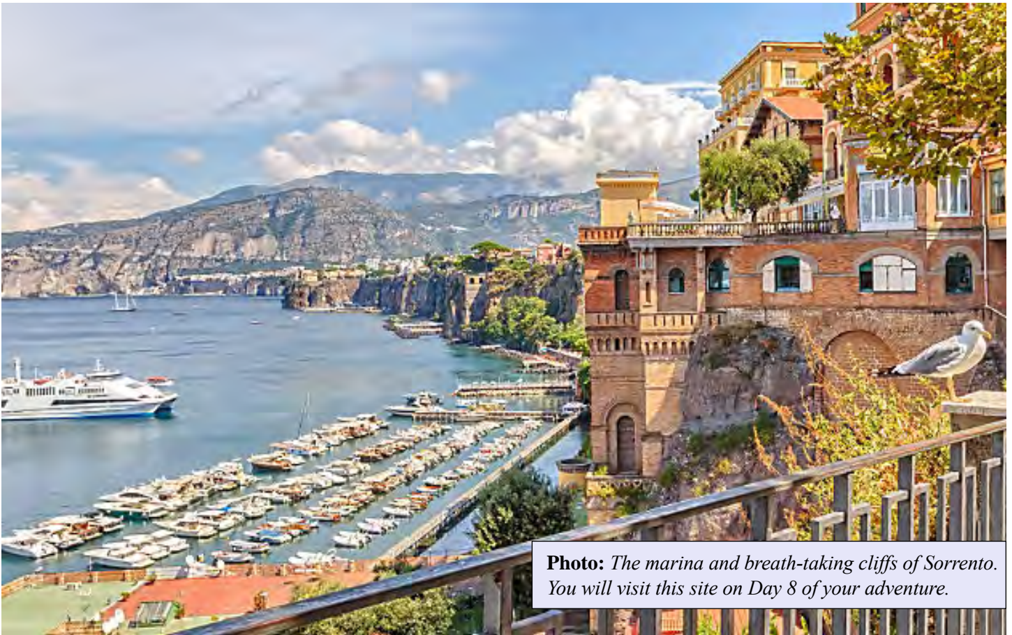
Photo: The marina and breath-taking cliffs of Sorrento. You will visit this site on Day 8 of your adventure.